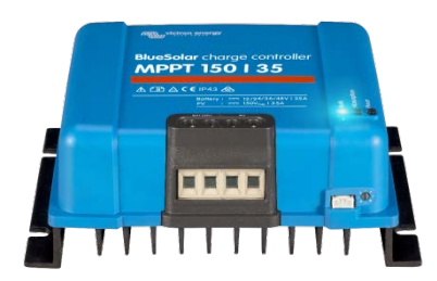
Solar Charge Controller MPPT 150/35