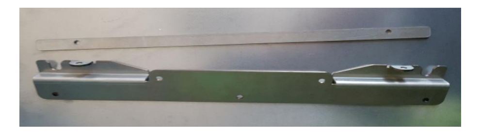
The StorageBox can be mounted on the floor or wall. Mount the box to the wall using the two brackets contained in the KIT:

In addition to the two brackets shown in the photo above, the KIT also contains the two necessary screws to fasten the two brackets together: